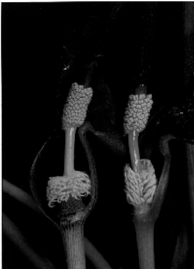
Figure 1. Inflorescences of Typhonium blumei (right) and T. roxburghii (left).

Subterranean stem subglobose to globose. Leaves long-petiolate, light green, not shining; petioles up to 25 cm long, slender, with basal sheath; blade reniform-hastate, triangular in outline, chartaceous, 7–11 cm long, usually as long as broad, cuspidate-acuminate at apex. Inflorescence on a short peduncle, usually solitary. Accrescent spathe base ellipsoid to ovoid; spathe blade spreading, ovate, long-cuspidate at apex. Lower spadix enclosed by accrescent spathe base; appendix slender, as long as spathe. Staminate flower zone 0.7–0.9 cm long; anthers dehiscent by slit. Pistillate flower zone ca. 0.4 cm long,